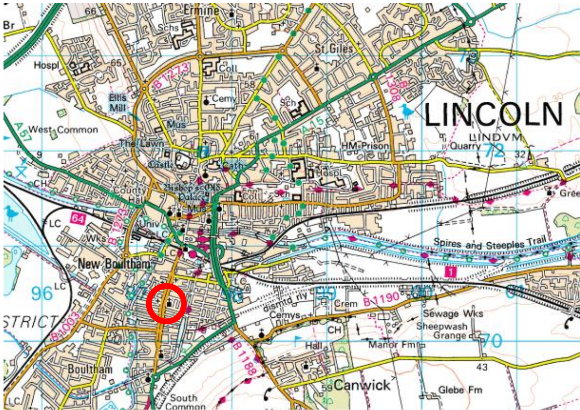
○ St. Peter-at-Gowts Church. (Lincoln High Street, LN5 7SR)